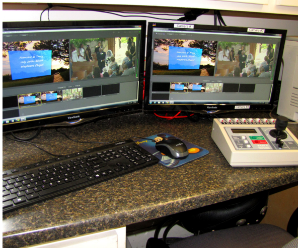
Wayfarers Chapel's workstation

"We stream our wedding ceremonies and Sunday services to Sunday Streams," says Steve. "Sunday Streams has been extremely accommodating and helpful in developing a solution for our needs and the volume we anticipate. Couples who choose the streaming option can enjoy their wedding as Video On Demand for two weeks after the wedding. We record an HDV signal on DV tape on the camera for backup and archival, Apple Pro Res files are recorded on the Atomos Ninja 2's for possible post production editing for Blu-Ray encoding and burning. Simultaneously, Wirecast allows us to record an .mp4 file of the live mixed ceremony/program locally. At the conclusion of the ceremony we drag and drop to a DVD Data Disc or thumb drive and present to the couple as they leave the grounds, approximately 40 minutes after the ceremony is over. The DVD is preprinted with the couples' names and date, and the optional thumb drives are imprinted with a Wayfarers logo."